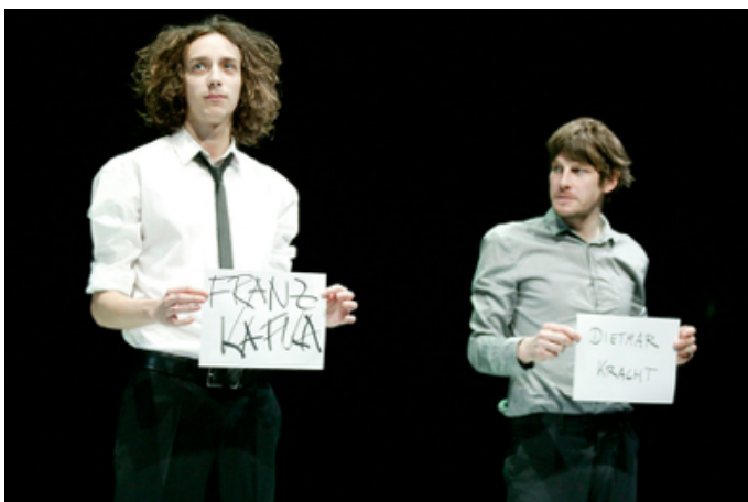
GERMAN VERSION OF GALAXY © DROITS RESERVES

Audience's time of arrival and leaving is kept open. There is no intermission. The spectators are free to leave and return any time they want, while this strange feast is going on and on. The performance continues, a bizarre celebration that must not be interrupted, a community of actors and spectators bound to recollect to the point of exhaustion so as to comprehend the mysterious conditions that formed the way we live our lives today.